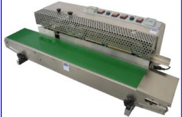
CBS 980 L

The operator inserts the edge of the bag into the side entry guide plate; the bag is then automatically forwarded, sealed and expelled at the opposite side.